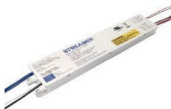
Emergency Battery Backup