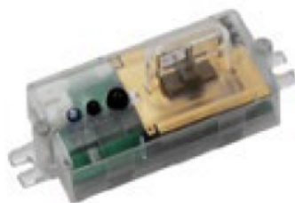
Microwave Motion Sensor (Merrytek)